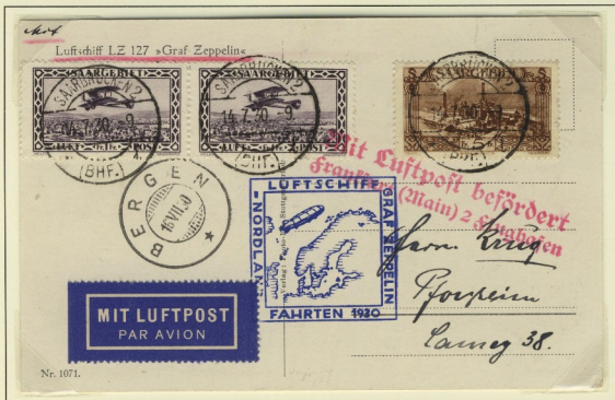
Postcard from "SAARBRÜCKEN 14.7.30" to Pforzheim, Germany. 7 Frs all-inclusive postage rate for postcards for all destinations. Dropped over Bergen, and postmarked on front "BERGEN 16 VII 30". Air mail via Frankfurt am Main.