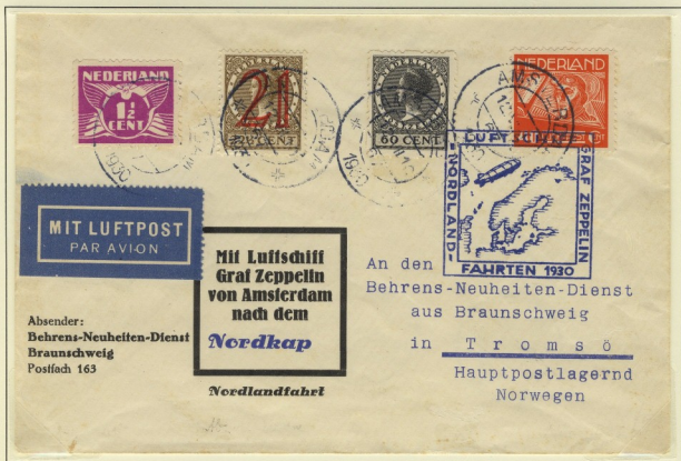
Cover from "AMSTERDAM 12.VII.1930" to Tromsø, Norway. 12½ cents base rate for letters 1928-1946 and 110 cents zeppelin surcharge in Europe 1929-1931, total 122½ cents. Dropped over Bergen. Backstamps "BERGEN 16 VII 30" and "TROMSÖ 22 VII 30". A total of 165 covers and 172 postcards with Dutch franking were carried on this flight.