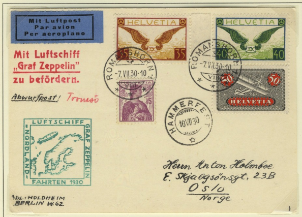
Postcard sent from "ROMANSHORN -7.VII.30" Oslo, Norway.

1.40 Fr all-inclusive postage rate for postcards to all destinations.