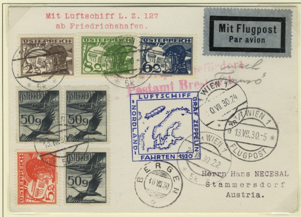
Postcard from "WIEN 10.VII.30" to Stammersdorf, Austria. 1 Groschen overpaid for the 1.70 Schilling all-inclusive postage rate for postcards to all destinations. Air mail via "WIEN FLUGPOST 13.VII.30". Dropped over Bergen, and postmarked on front "BERGEN 16 VII 30" and "WIEN 20.VII.30".