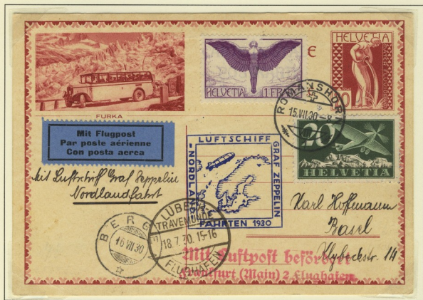
Postcard from "ROMANSHORN 15.VIII.30" to Basel, Switzerland. 1.40 Fr all-inclusive postage rate for postcards for all destinations. By air mail via Lübeck and Frankfurt (Main) to Friedrichshafen. Dropped over Bergen, and postmarked on front "BERGEN 16 VII 30".