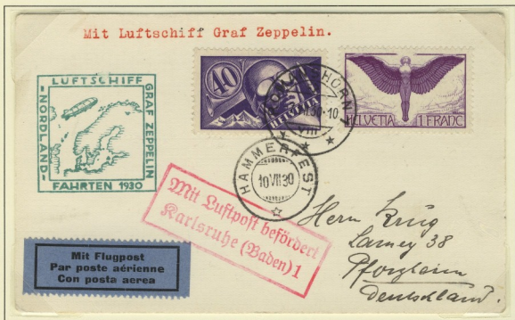
Postcard sent from "ROMANSHORN -7.VII.30" to Pforzheim, Germany.

Dropped over Hammerfest, and postmarked on front "HAMMERFEST 10 VII 30".