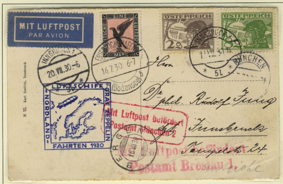
Postcard from "INNSBRUCK 20.VII.30" to Innsbruck, Austria. 10 Groschen postcard rate, and German 1 RM franking for the zeppelin air mail surcharge. This franking is highly unusual, because Austrian franking could pay for the zeppelin surcharge. Dropped over Bergen, and postmarked on front "BERGEN 16 VII 30". Air mail via Breslau (Wroclaw), Poland and Munich, Germany.