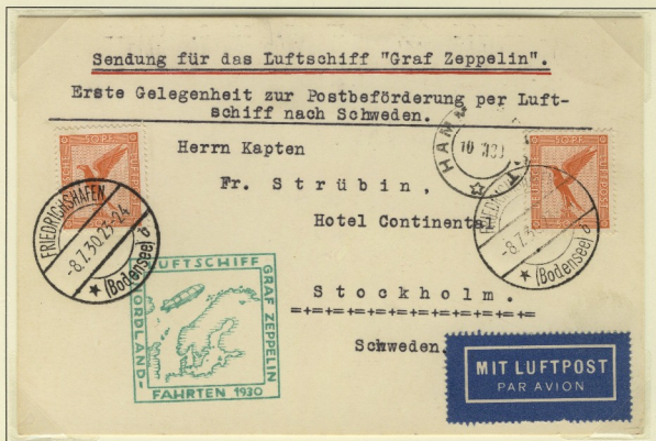
Postcard to Sweden from "FRIEDRICHSHAFEN -8.7.30". Dropped over Hammerfest and postmarked "HAMMERFEST 10 VII 30". 1 RM all-inclusive postage rate for postcards to all destinations.