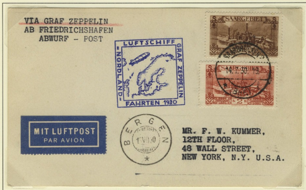
Postcard from "SAARBRÜCKEN 14.7.30" to New York, U.S.A. 7 Frs all-inclusive postage rate for postcards for all destinations. Dropped over Bergen, and postmarked on front "BERGEN 16 VII 30". Backstamped "FOREIGN SECTION / G.P.O. N.Y.".