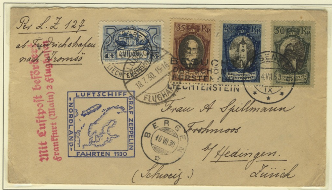
Cover sent from “TRIESENBERG 14.VII.30” to Hedingen, Switzerland. 5 Rappen underfranked, the all-inclusive postage rate for letters was 2.80 Fr. Dropped over Bergen, and postmarked on front “BERGEN 16 VII 30”. Air mail via “LÜBECK 18.7.30” and Frankfurt am Main. Backstamped “HEDINGEN 19 VII 30”.