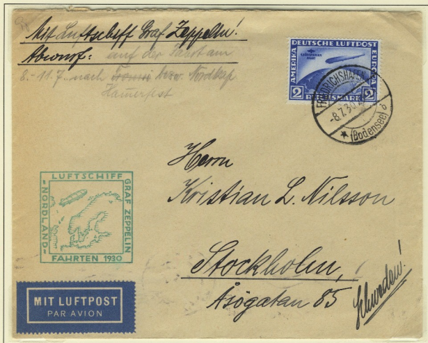
Cover to Sweden from "FRIEDRICHSHAFEN -8.7.30". Dropped over Hammerfest and backstamped "HAMMERFEST 10 VII 30". 2 RM all-inclusive postage rate for covers to all destinations.