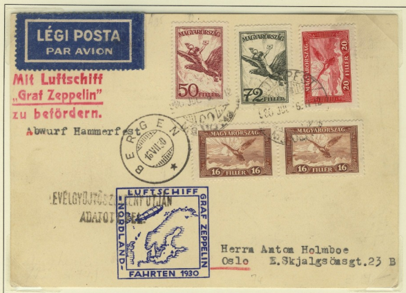
Postcard sent from “BUDAPEST 930 JUL -6” to Oslo, Norway. 20 filler postcard rate, 50 filler air mail surcharge and 1 pengő zepplin surcharge, total 1.70 pengő postage rate. 2 filler overfranked. Dropped over Bergen, and postmarked on front “BERGEN 16 VII 30”.