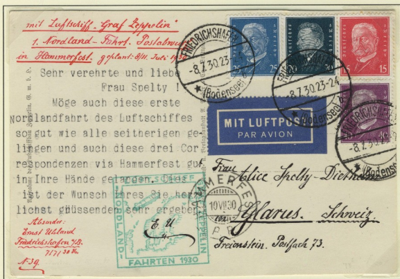
Postcard addressed to Switzerland from "FRIEDRICHSHAFEN -8.7.30". Dropped over Hammerfest, postmark "HAMMERFEST 10 VII 30". 1 RM all-inclusive postage rate for postcards to all destinations.